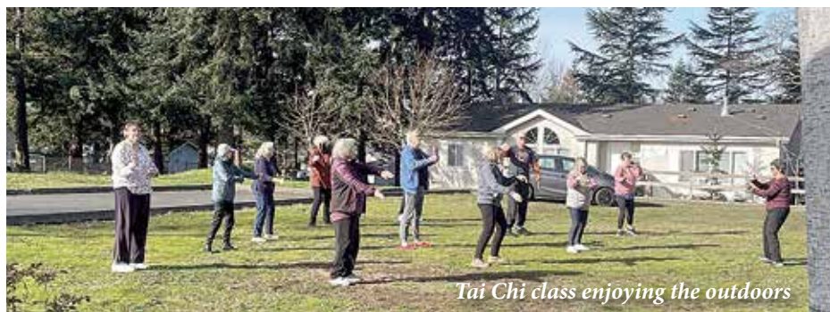
Tai Chi class enjoying the outdoors