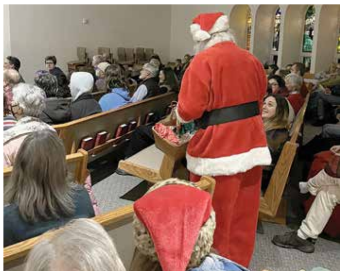
A very special guest will make an appearance at the end of each of Whidbey Island Orchestra's holiday concerts this weekend.

holiday repertoire, 'A Vaughn Williams Christmas,' featuring hauntingly lovely English carols, as well as 'The German Carol Festival,' full of the 19th Century songs we've all come to know and love, such as 'O Tannenbaum' and 'Silent Night.'"