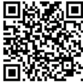
Scan this QR code for information and an application to participate in the 2024 Wearable Art Show at The Center in Oak Harbor.

The final application deadline is March 15. All those interested can scan the QR code included here or find all information and applications online at ohscfoundation.org. Tickets for the April 20 fundraising event will likely go on sale near the end of February or the beginning of March. This event has sold out in the past, so those interested in attending are encouraged to buy their tickets early.