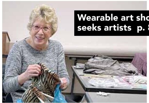
Wearable art show seeks artists p. 8