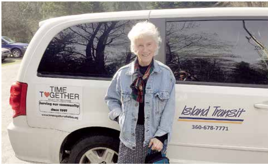
Thank you Island Transit for your generosity in supplying a Ridelink van to Time Together. With your help we can now provide door to door transportation for participants in the program. We couldn't do it without you!