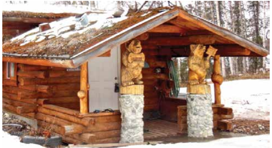
By Auston Reisman Farmer, Parent, Builder, Nonprofit Leader of Compost Cultivators

Early humans lived under trees and stars and improvised with the abundant natural materials in their region. In primeval times, hunters and fishermen naturally sought shelter in rock caves. These were humans' earliest dwellings. Tillers of soil took cover under the trees' arbors, fashioning huts of branches and mud. Shepherds following their flocks used skins stretched on poles to form tents. People constructed shelters, grew and foraged for food, and made their own clothes within small bands or tribes. That knowledge of their unique building crafts and skills was passed along through generations, from master to apprentice.